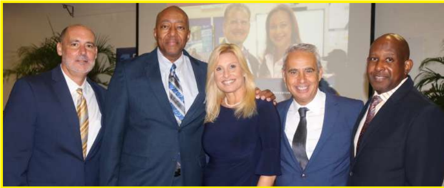
Leadership Team - Opening of Schools

Despite unprecedented challenges the pandemic conditions presented we are pleased to report this year's Opening of School Meeting for Adult/Technical Colleges, Division of Educational Opportunity, and Access (DEOA) region resulted in one of the best recorded Openings of Schools on record, as reported by the leadership team. Staff from both the DEOA and Adult Education divisions appeared delighted and enthusiastic to gather and celebrate this success in the same room during our Opening of Schools meeting, particularly in light of having been more than a full year in lockdown.