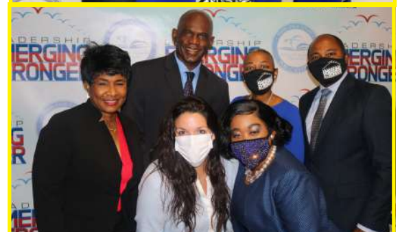
Opening of Schools Planning Committee